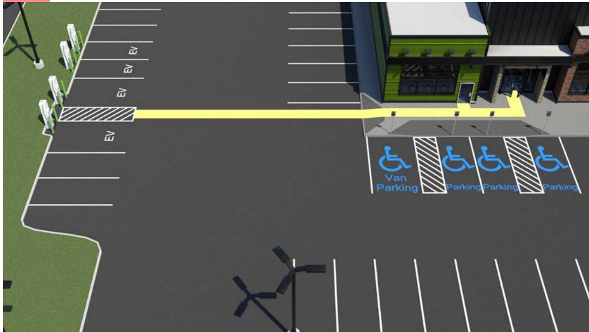
Figure 11.8.A Typical Charger Stations showing Van Accessible Spaces. Dimensions should be in accordance with State and ADA Building Codes

Delete existing Figure 11.8.A—EV Charger Station and Design, including Accessible EV Charging Stations