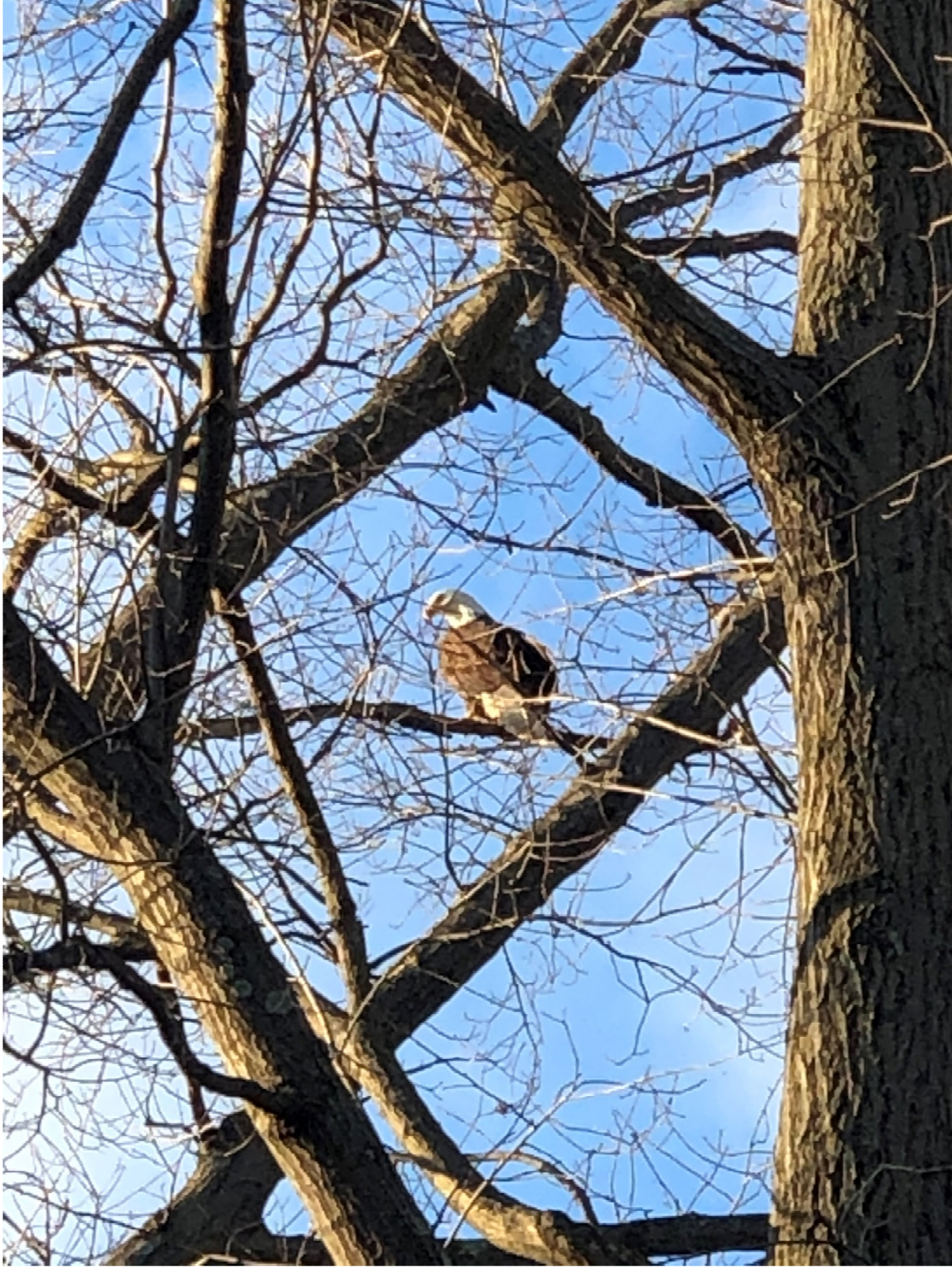
5 Bald Eagle Photo on Edgewood Drive on 6 February 2020 (See provided sworn Affidavit).