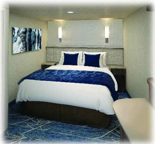
Inside Cabin - IA